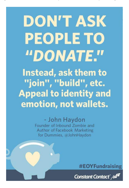
Picture 2

The main story, that is the story you will post and distribute the most, must be short and precise. This is the story your whole campaign will be based upon and everything else will relate to.