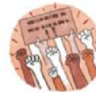
Social and political peace