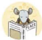
What is peace?

https://sci.ngo/resources/online-courses/