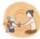
Peace with others