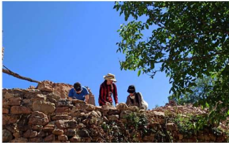
Eco-camp in Envall (Catalonia), July 2022

Furthermore, we completed these guidelines with the lessons learned from our pilot eco-camps.